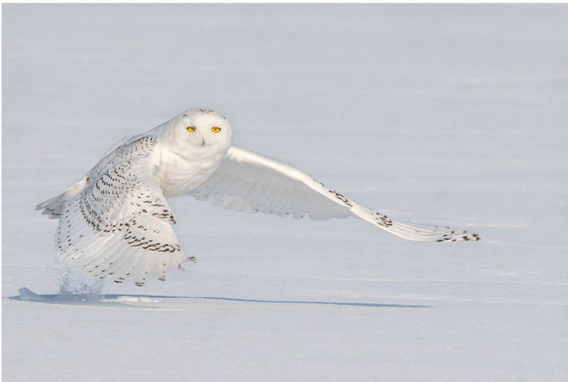
“Snowy Owl Taking Off” Intermediate Hugues de Milleville