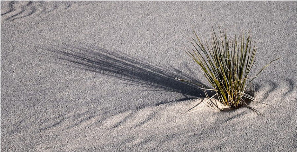
“Yucca” Superset Carm Griffin