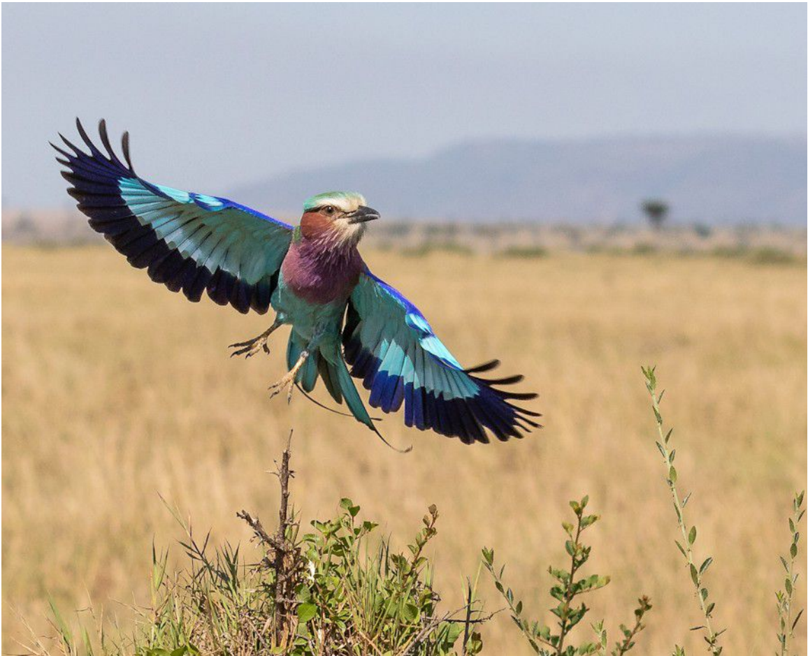
“Lilac-breasted Roller” Superset Kent Wilson